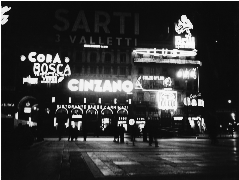
Figure 5. Paolo Monti, Night view of the Piazza Duomo, Milan, 1950–1970 C.085.18.03. On the top right is the advertisement for Brill shoe cream.

Between 1956 and 1957, we arrived in Genoa[;] I don't remember almost anything about the arrival in Genoa, nor [do] I recall when we arrived in Milan[;] we came [to] Milan by train. I remember only one evening, when my father took us for a tour of the city, the facade opposite to the Dome [was] full of coloured advertisements, neon lights, that for us were something new[;] we hadn't seen something like this in Egypt[, and I remember one advertisement in particular, it a silly thing perhaps, but ... the man who cleaned his shoes, a little man who showed how his shoes shone. 81