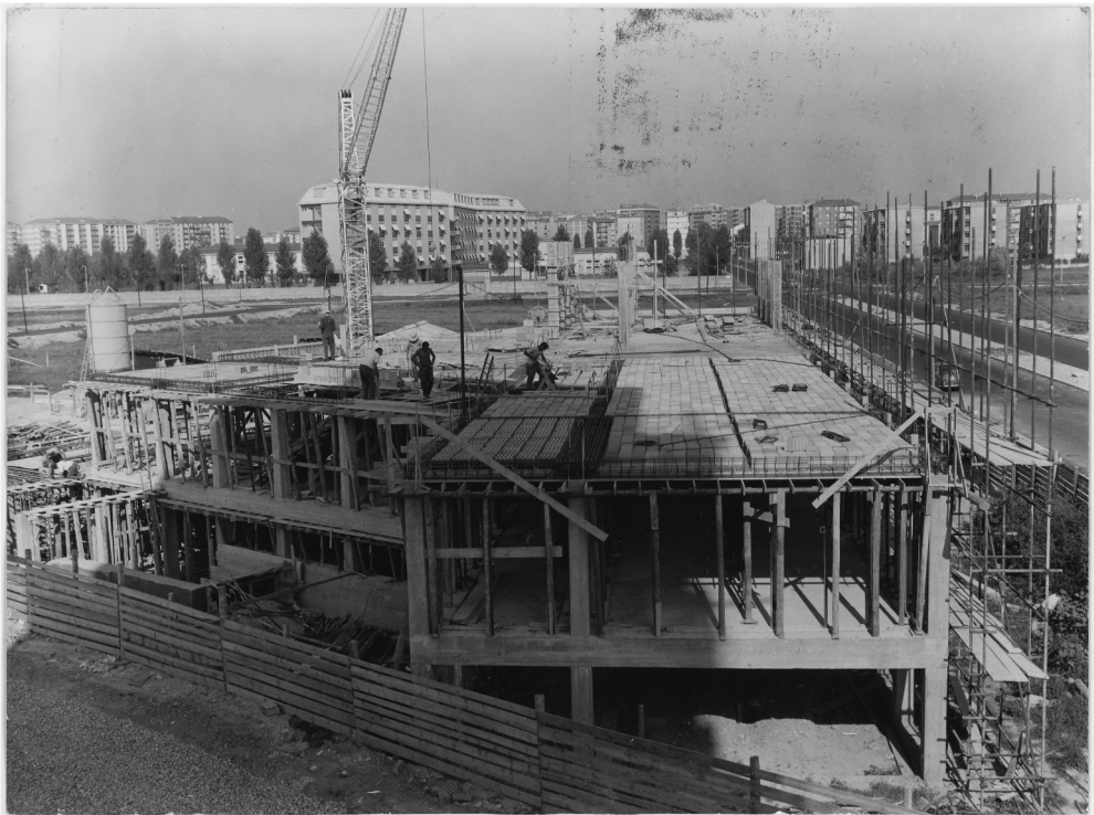
Figure 2. Animated view of the construction site of the new Jewish school in via Sally Mayer, Milan, 1960 (inv. 133-s102-007).

As Egyptian Jewish families began to permanently settle in Milan, the community was confronted with a major issue. To Egyptian families, it was important to provide their children with a modern education, preferably still in a Jewish environment. The increasing number of pupils coming from refugee families made the continued use of the old Jewish school in via Eupili – northwest region of Milan – impossible. It became too small, and the community was obliged to invest in constructing a huge building that, at its peak, would host more than 1,000 pupils, from nursery-school-age to high-school-age. The building was constructed in the area bridging the neighbourhoods of Primaticcio and Lorenteggio and the school was inaugurated in 1963. It included a synagogue and now also hosts the offices of the Jewish community (Figure 2).